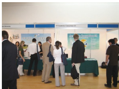
Many guests visited AC21's exhibition booth at the Conference