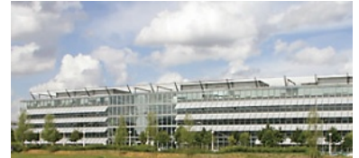
Ecole Nationale des Ponts et Chaussées

AC21 Student World Forum was established for the purpose of providing students (of AC21 member institutions) from all over the world with an opportunity to discuss and exchange ideas concerning pressing international issues, sharing their perspective from different cultural backgrounds. The first forum was held at Nagoya University in 2005 with the theme, "Coexistence of Nature and Humans".