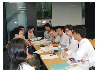
Students discussing "Ecotourism"