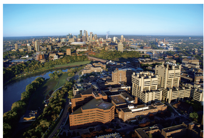
The University of Minnesota, Twin Cities campus is located on the banks of the Mississippi River near the downtown core of the city of Minneapolis.

the banks of the Mississippi River at the heart of one of the nation's most vibrant, diverse metropolitan communities. With a population of 2.8 million, the Twin Cities are the 16th largest metropolitan area in the U.S. Minnesota is home to the world-renowned Mayo Clinic and the headquarters of 21 Fortune 500 companies, including 3M, Medtronic, and Cargill. Faculty and students benefit from extensive partnerships with world-renowned health centers; international corporations; government agencies; and arts, nonprofit, and public service organizations.