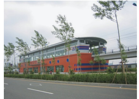
Picture 1 A light rail station in Changchun To build a sustainable Changchun city, we have to stop reconstruction and over construction to save more space and resources for the future. The government should and has to work hard on city planning to develop in harmony. Then we are closer to the sustainable city.

The biggest problem is the lack of efficient overall planning. It is a common issue all over China, not only in Changchun. We do have planning on urban layout, transportation, environment and so on. The problem is that no one really takes it seriously. It is just a routine document in the cartulary and usually handed in after the construction. Most decisions are made by certain people in the government. New office buildings, fancy theaters, huge stadiums high-tech airports, and modern rail stations do make the city looks good and that makes the local government look good. But do we really need that stuff? Should not we think before we leap? Pity is people tend to have short sight when they are at a certain status and let reconstruction and over construction block the sustainable city process.