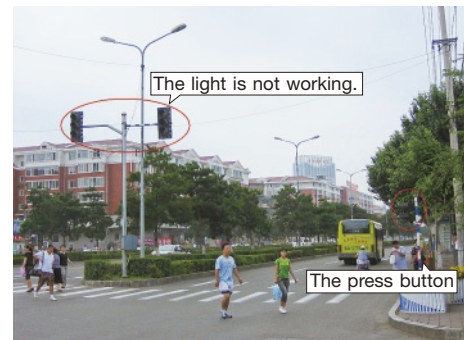
Picture 2 The not-working traffic light As thousands of cities in China, Changchun is developing very fast. And it is developing quite well. If we can solve those problems such as over construction and put the investment into more meaningful project, Changchun will soon develop into a sustainable city.

am so surprised that it does not have a lavatory for passengers.