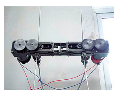
Fig. 1 Calibrated robot for laser tracking test

A novel measurement for robot errors is proposed through the cooperation of three universities with support from the AC21 special project fund. The laser coarse-fine coupling tracking measurement is carried out in the measurement for robot dynamic or static errors. The research objects include robot pose, motion trajectory and parameter relationships between dual robot base coordinates. A calibrated robot is shown in Fig. 1. The measurement can not only meet the requirements of the large range, rapid response and dynamic tracking, but also achieve the high accuracy of submicroradian magnitude due to the particular opto-mechanical design with low cost. The research contents can be summarized as follows.