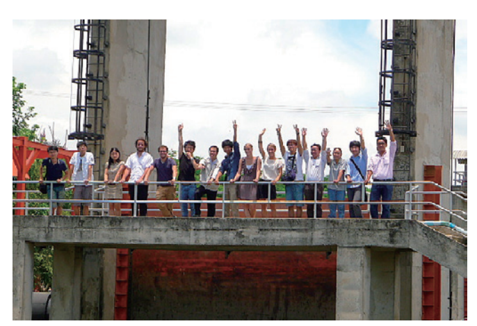
At the watergate