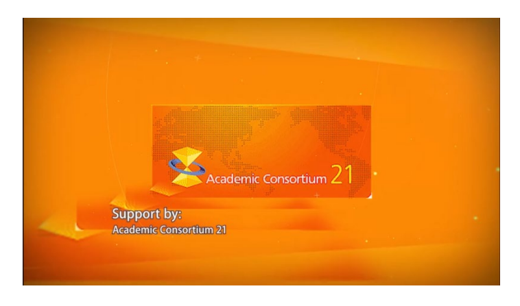
Figure 2. AC 21 Logo in our videos

Funded by AC21, Environmental Management and Policy Analysis Center (EMPA) and International Environmental Global Institutes (IGES), we cooperated with a professional video production company, to make the high quality video materials which promoted the barrier-free communication among scholars and the general public. Inspired by the AC21 special fund project, we initiated an Energy, Environmental and Climate Change (EECC) Salon Series, to invite experts, industrial leaders and lay person who have interests and experience in this field to share their ideas. We believed that, to some extents, we are all "blind men", who only touched pieces of a huge elephant. We want to bring more pieces together to enlighten the world. These videos will be uploaded as the supporting materials of the international course titled Environmental Policy Analysis as well as the MOOC with the same name, which will be online next April